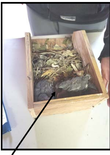
2 Chicks in compartment