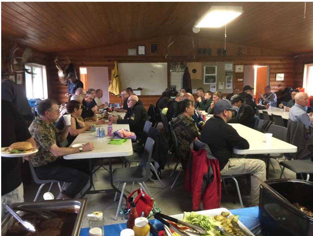
LUNCH BREAK — NICE AND WARM AND LOTS OF GOOD FOOD