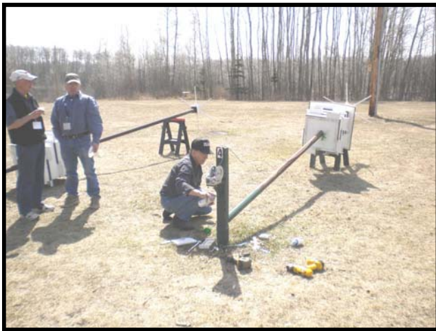
Bird House being installed