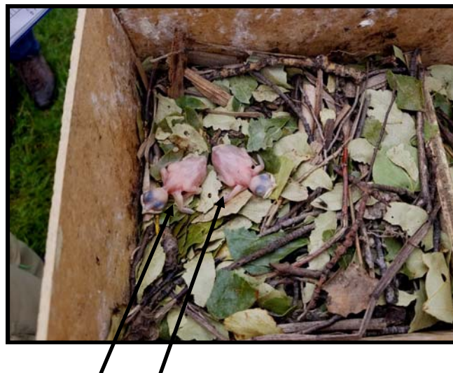
2 Chicks newly hatched with no