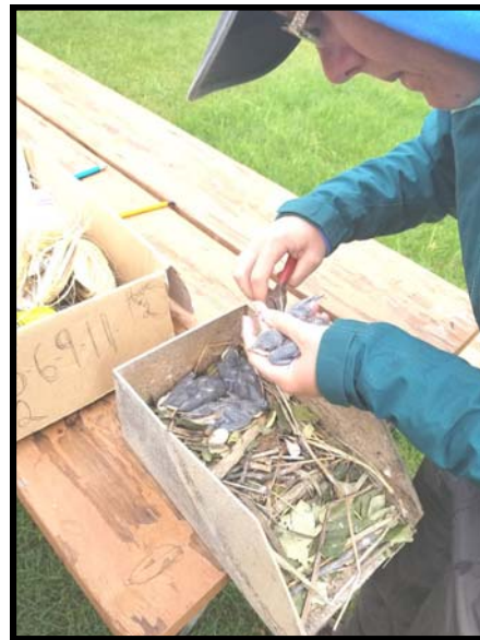
Chick being banded