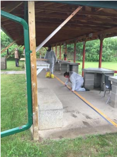
Working on the ranges