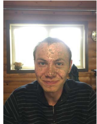
How to get a Mud Facial? Take a ride in a trailer behind an ATV