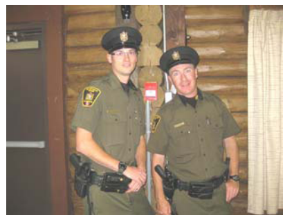
Hunter's Night attendees and guests